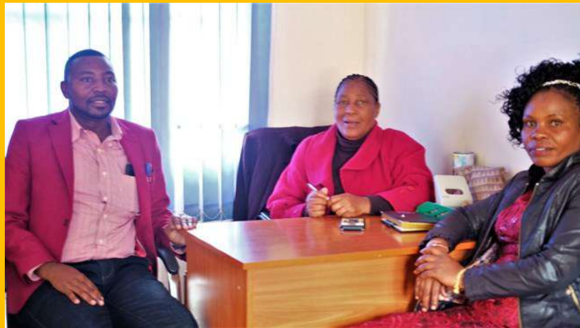
Strong families have been the pillars of our churches