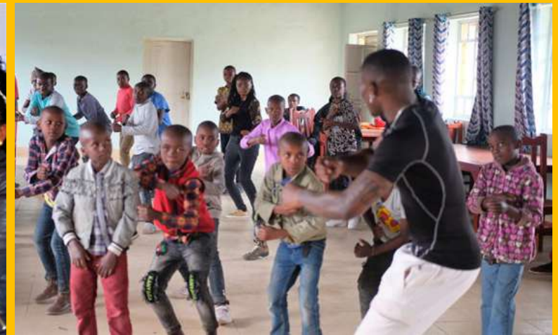
GOA children also get helped to heal from their past experiences and live to pursue their dreams